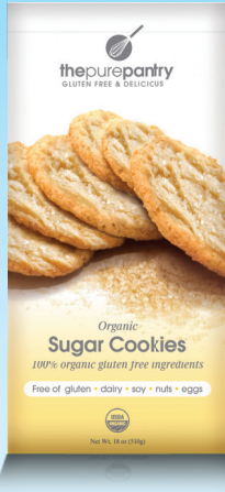
Organic Sugar Cookies