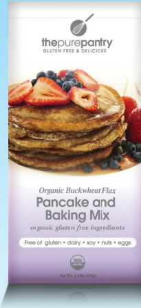
Organic Buckwheat Flax Pancake and Baking Mix