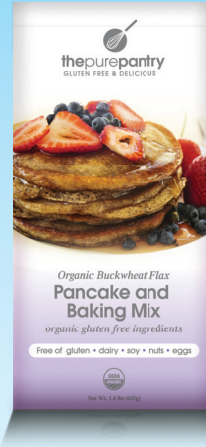
Organic Buckwheat Flax Pancake and Baking Mix